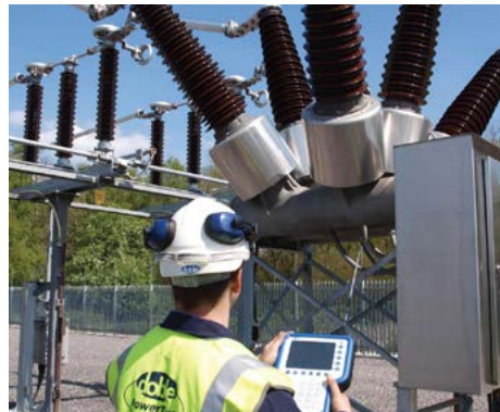
On-line substation partial discharge survey using Doble PDS100.