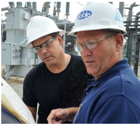
On-site condition assessment & consulting services