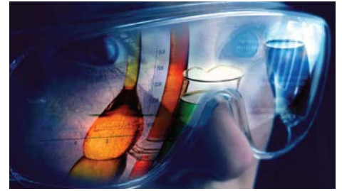
Doble provides complete laboratory analysis and engineering guidance.