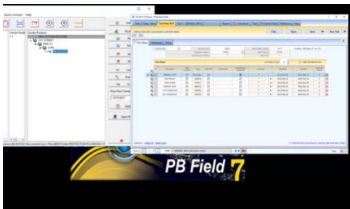
Protection Suite test macros are used from within PB Field test routines